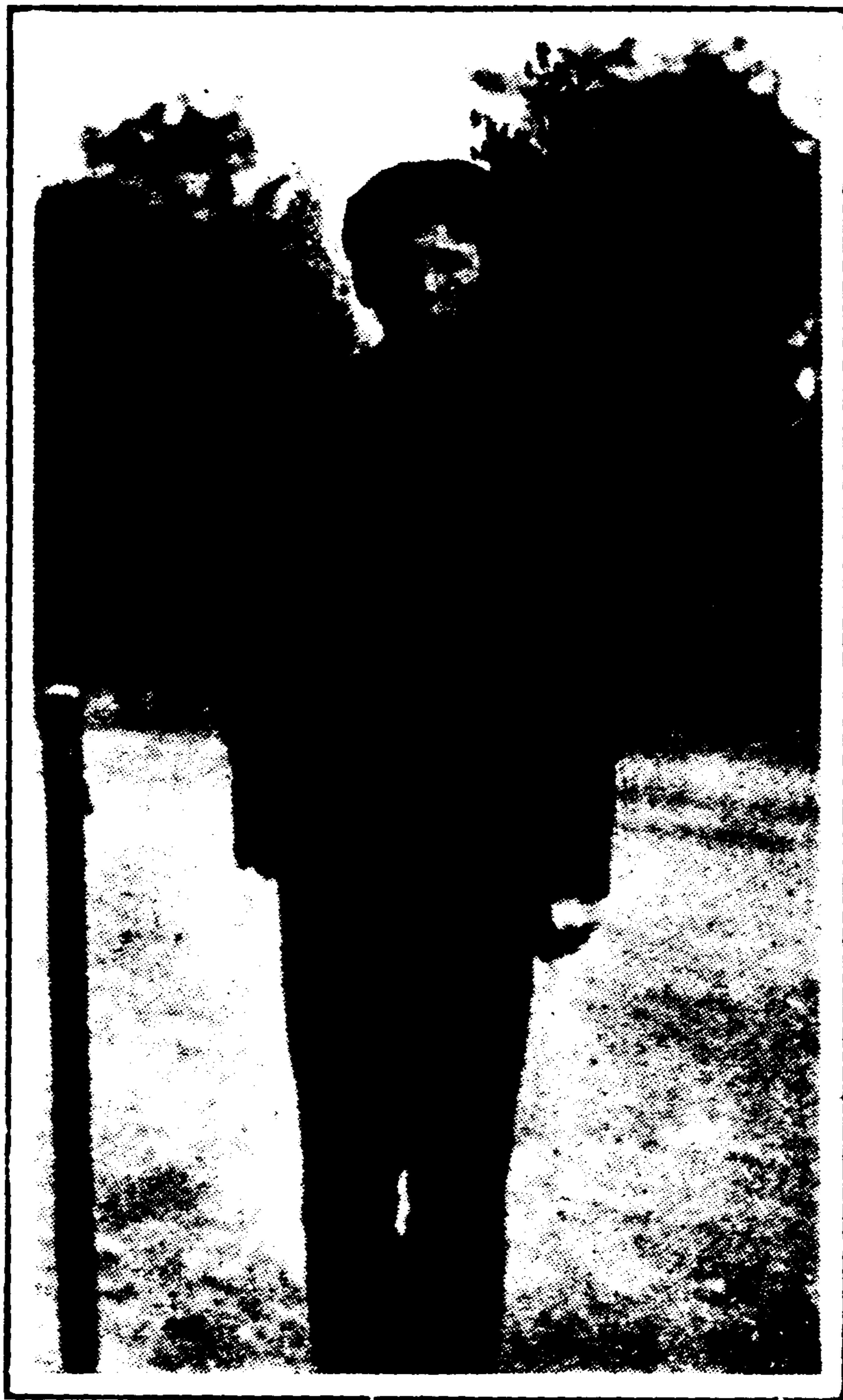
AN HONORABLE DISCHARGE?

The welfare of the breaker boy is of very minor concern in the coal region, and readers of this paper must not suppose that "child labor" is a vital topic there. No subject is less frequently discussed. The churches are almost wholly silent. Nobody seems disposed to "dodge the issue." No issue is recognized. With many operators the employment of children is simply a part of an industrial process into which the thought of the development or the dwarfing of a human life does not enter.