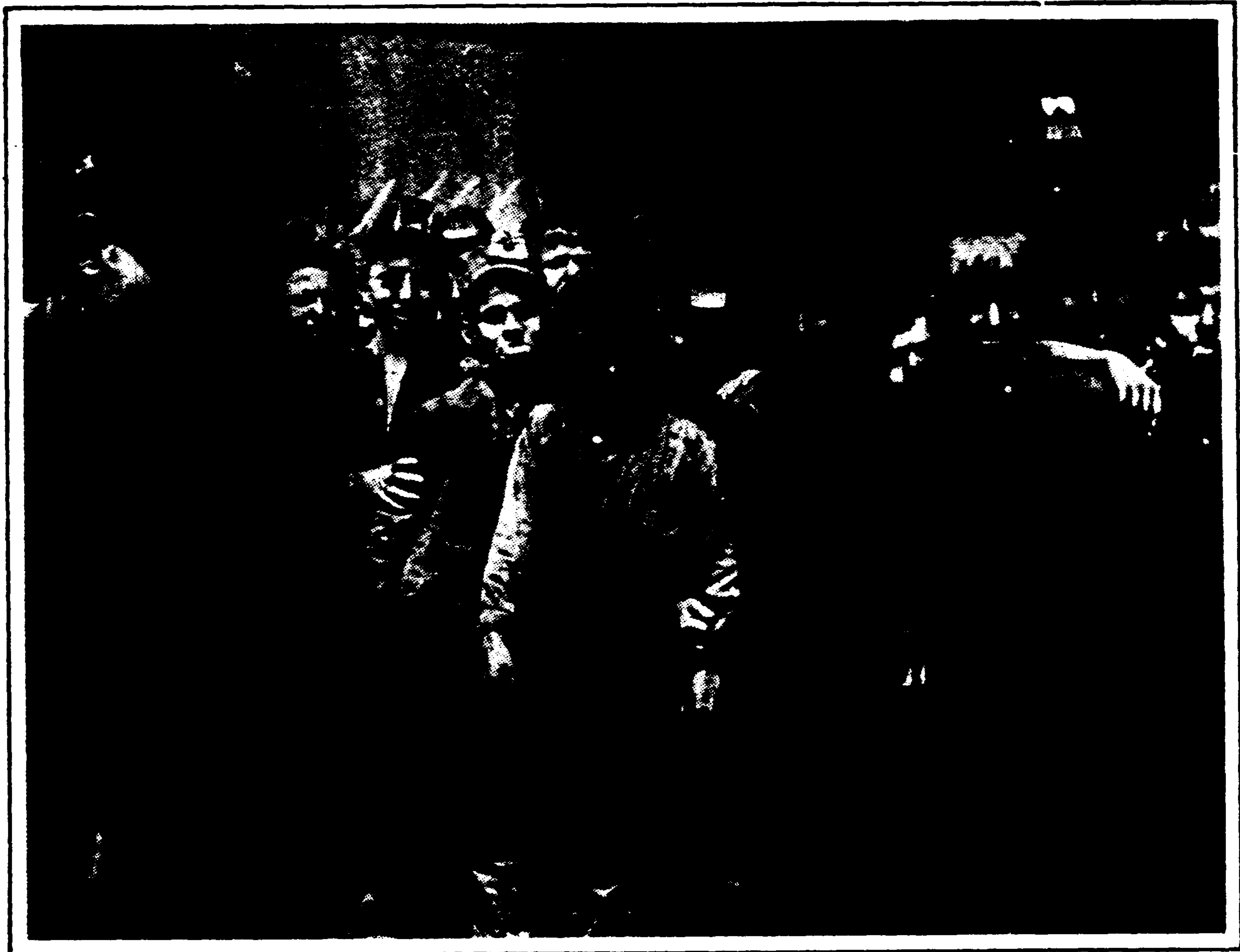
“THE LITTLE DEVILS LIKE IT.”

some shameful design. The smoky whale-oil lamps in the caps of the little blackened boys, bobbing up and down as they moved their heads at work, cast flickering shadows and added to the weirdness of the scene. The sunlight was forgotten, and the worth and dignity of human life