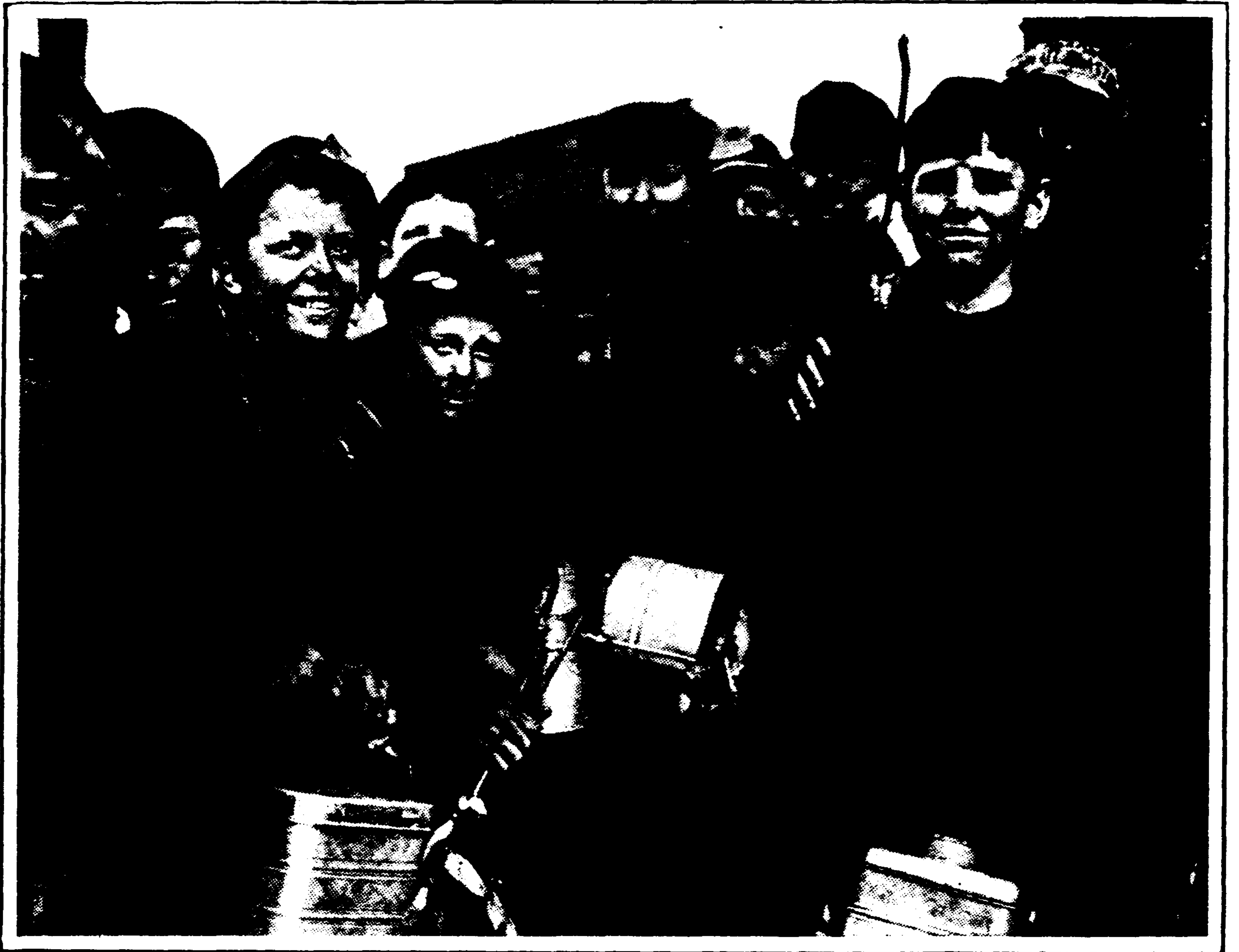
FOOLING THE INSPECTOR.

In rare bursts of confidence boys twelve and thirteen years old who tend doors inside the mine, where child labor is forbidden under sixteen years, will gleefully relate how they outwitted the mine inspector on his last visit. "De boss put de drivers nippin' an' de runners drivin' an' de laborers runnin' an' hid us away on de gob.* Dat was a cinch to get pay for sleepin' all day on de gob." Such instances do not reflect on the integrity or the ability of the mine inspectors. Each one is set to do the